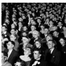
The Magic of Movies