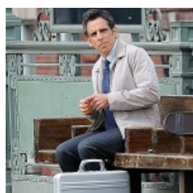
Is it Christmas Yet?